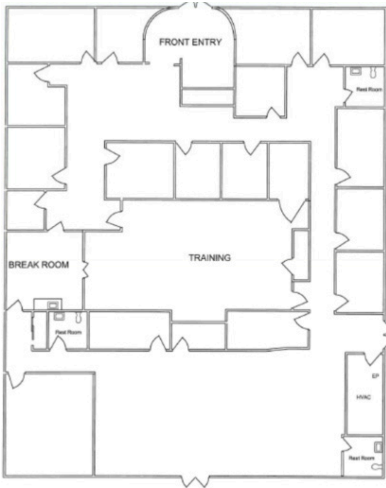
217 CLARKSON ROAD

314.408.7400 (Office) 636.328.4828 (Mobile) Josh@LCGCap.com